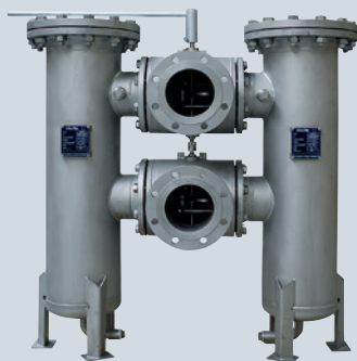
KDF-V Stainless steel