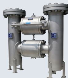
PN 64/DN 150