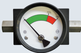
Magnetic piston pressure gauge for differential pressure

We produce and deliver additional design and material variants on request. We solicit your request.